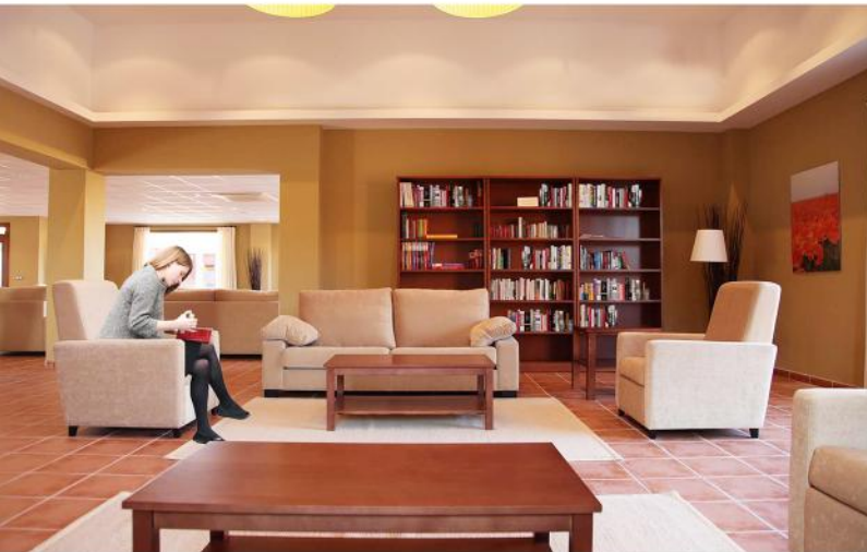
Private Social Club